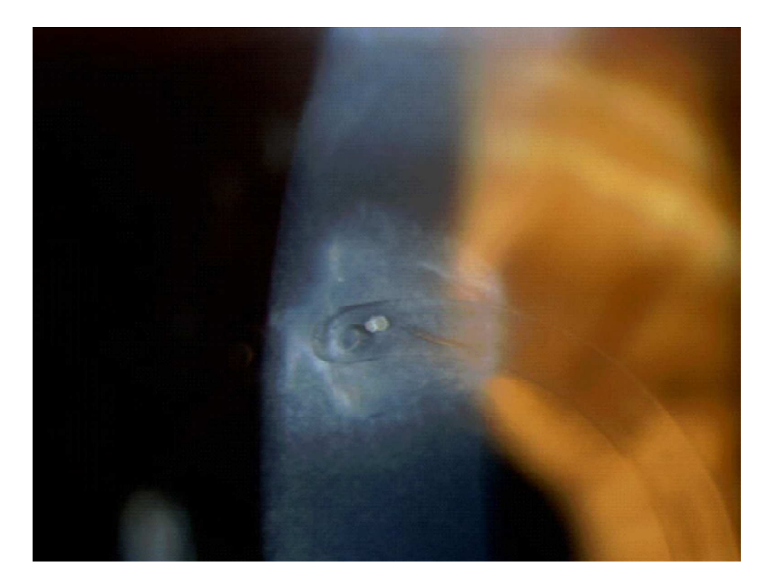
Corneal melting above the ring segment due to superficial implantation. 569x429mm (300 x 300 DPI)