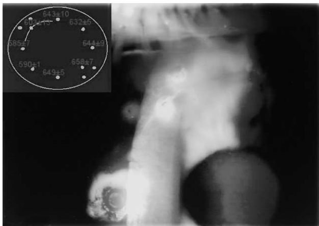
Figure 1. (Kymionis) Slitlamp photograph at the CK-treated spot (within the groove of the previous AK incision) with corneal perforation. Number, location, and pachymetric measurements (mean \pm SD) of CK-treated spots in correlation with the previous AK incision are indicated (top left).

keratomileusis was performed to correct the residual astigmatism using the automated Summit Krumeich-Barraquer microkeratome (Alcon) with a 130 \mu m plate and the Aesculap-Meditec MEL 70 excimer laser. The procedure was uneventful, and no intraoperative or postoperative complications related to the previous AK incision or LASIK were observed.