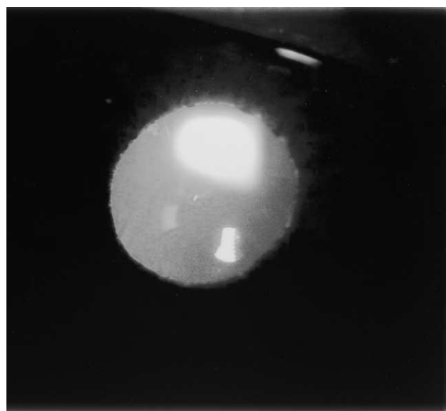
Figure 3. (Kymionis) Slitlamp photograph shows the area of ACO.

After 3 months, the UCVA was 20/25 and the BCVA was 20/20 in both eyes; the manifest refraction was -0.75 \times 145 in the right eye and +0.50 -0.75 \times 160 in the left